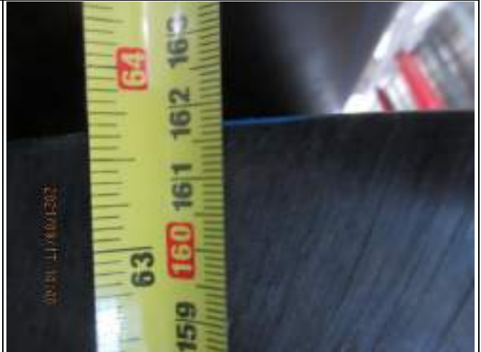
Pic.18 Dimension check