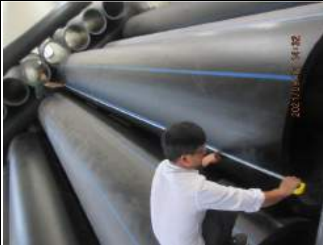
Pic.15 Dimension check