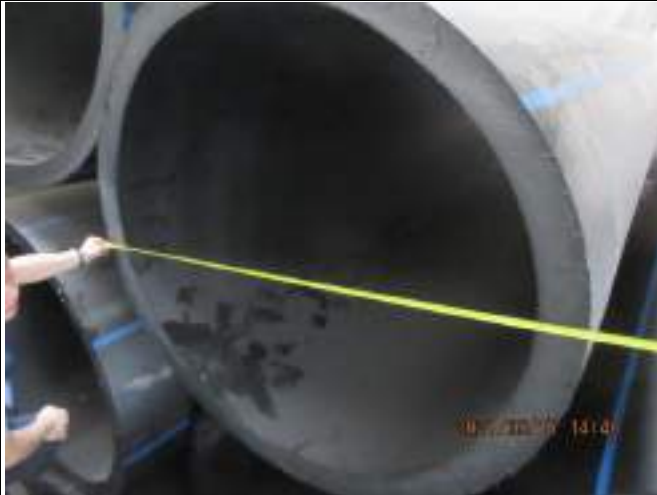
Pic.17 Dimension check