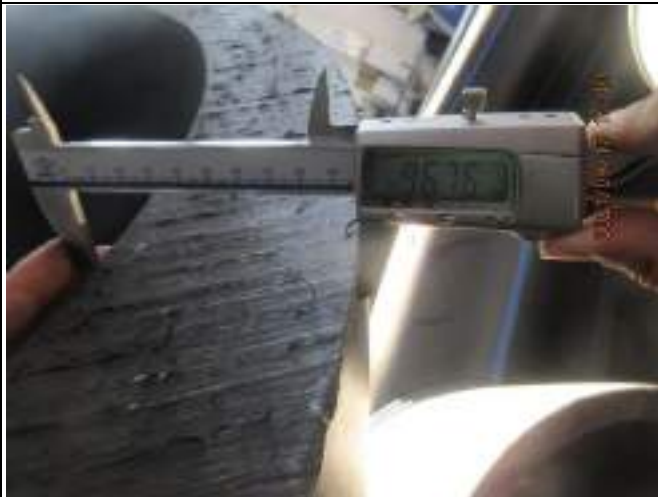
Pic.25 Dimension check