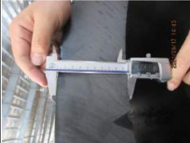
Pic.23 Dimension check