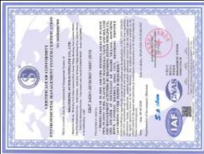
Pic.27 Document provided by factory