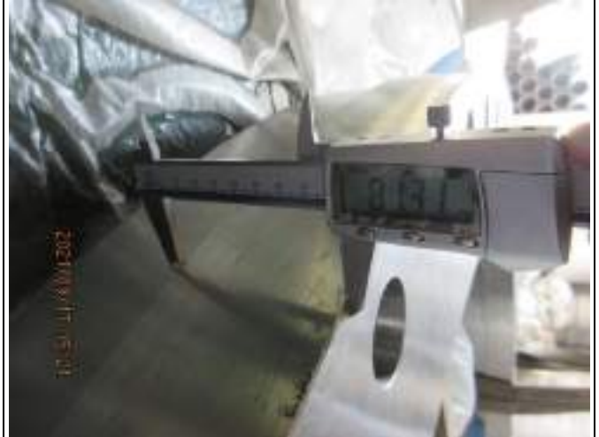
Pic.24 Dimension check