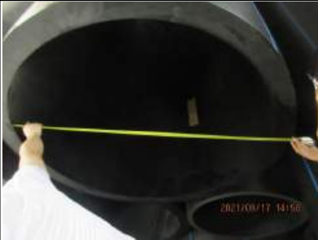
Pic.19 Dimension check