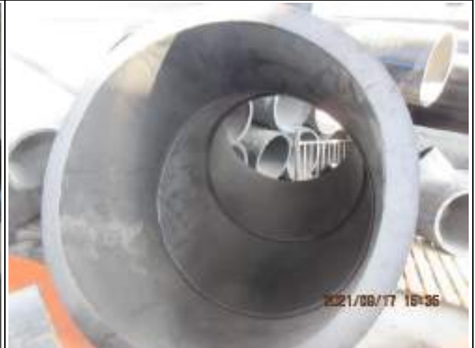
Pic. 14 Product