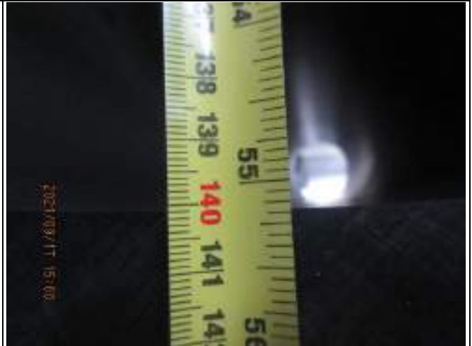
Pic.20 Dimension check