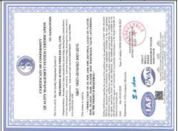
Pic.26 Document provided by factory