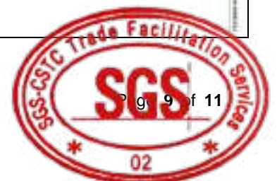
Pic.34 Document provided by factory